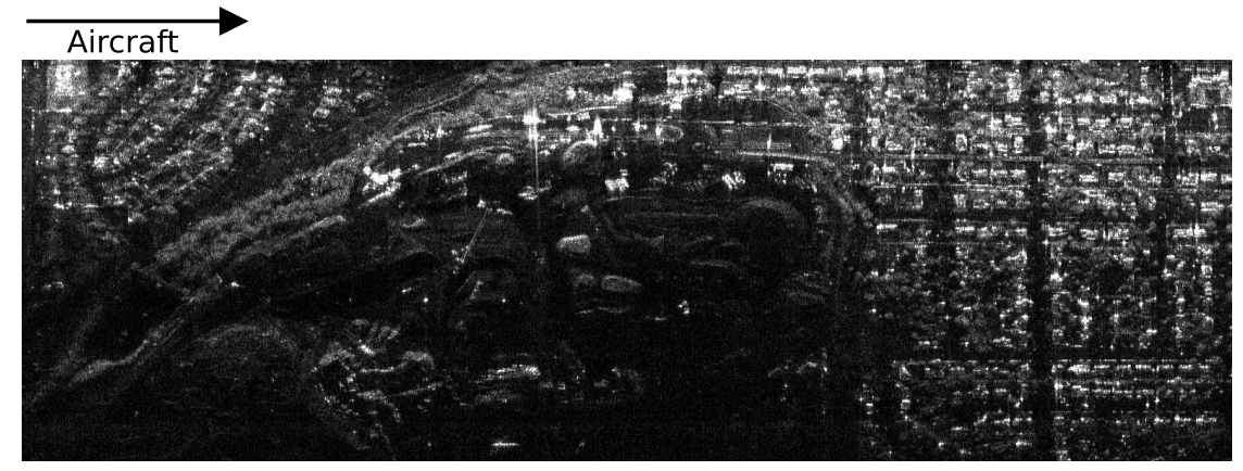
Figure 3. Stripmap SAR image of a portion of Brigham City, UT processed from data gathered using microASAR on the Surf Angel testbed. The suburban area is interrupted by a gravel pit in the center of the image which is much less reflective.

data gathered on the testbed is stored for later analysis, the aircraft has been fitted with a rack-mount computer which acts as a data storage and processing system. The computer has been outfitted with 320 GB of solid-state storage, which is more robust than rotating disks in the high vibration environment of an aircraft. Two gigabit ethernet controllers allow simultaneous recording of data from two separate SAR systems as well as providing a means of controlling the functions of the SAR systems. The computer system also has enough memory and processing power so that it may be used to test real-time data compression and processing algorithms during flight.