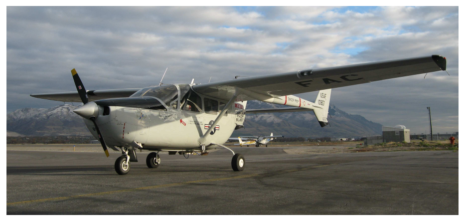
Figure 2. The O-2 Skymaster, dubbed "Surf Angel", which is being used as an airborne SAR testbed. With the wings mounted on top of the fuselage, the pilot and radar operator can easily observe the ground below. Radar antennas are mounted beneath the aircraft and angled so that they radiate toward the passenger side.